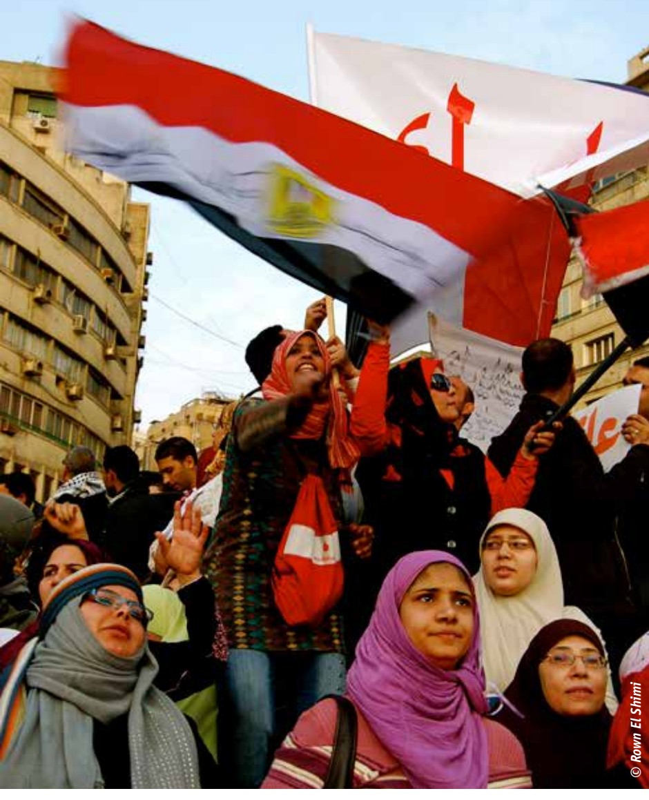
At the beginning of 2011, mass demonstrations at Tahrir Square in Cairo, Egypt led to president Mubarak stepping down

'As democracy becomes more westernized, it loses support'