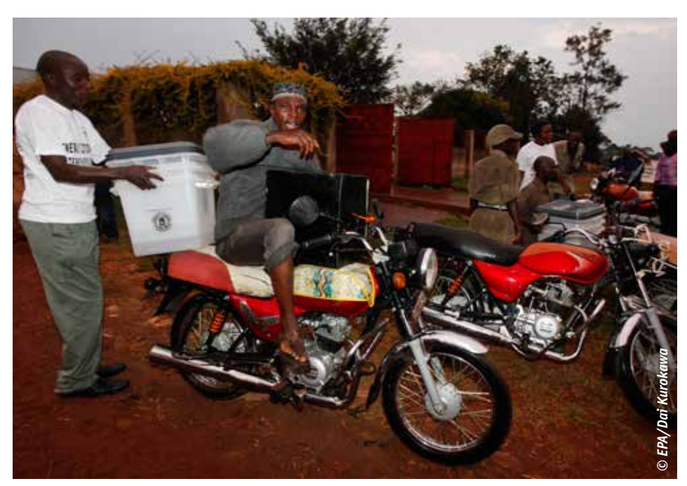
A boda boda (motorcycle taxi) transports ballot boxes and papers in Mukono during the 2011 elections

in elections. If you lose, that doesn't mean you haven't had a fair chance.' He doesn't understand many of the concerns of the opposition, such as those about the Electoral Committee. 'They may be appointed by the president, but that doesn't mean that they don't operate independently. The opposition wants a selection committee. But that way you create a bureaucracy for problems that can be solved simply.'