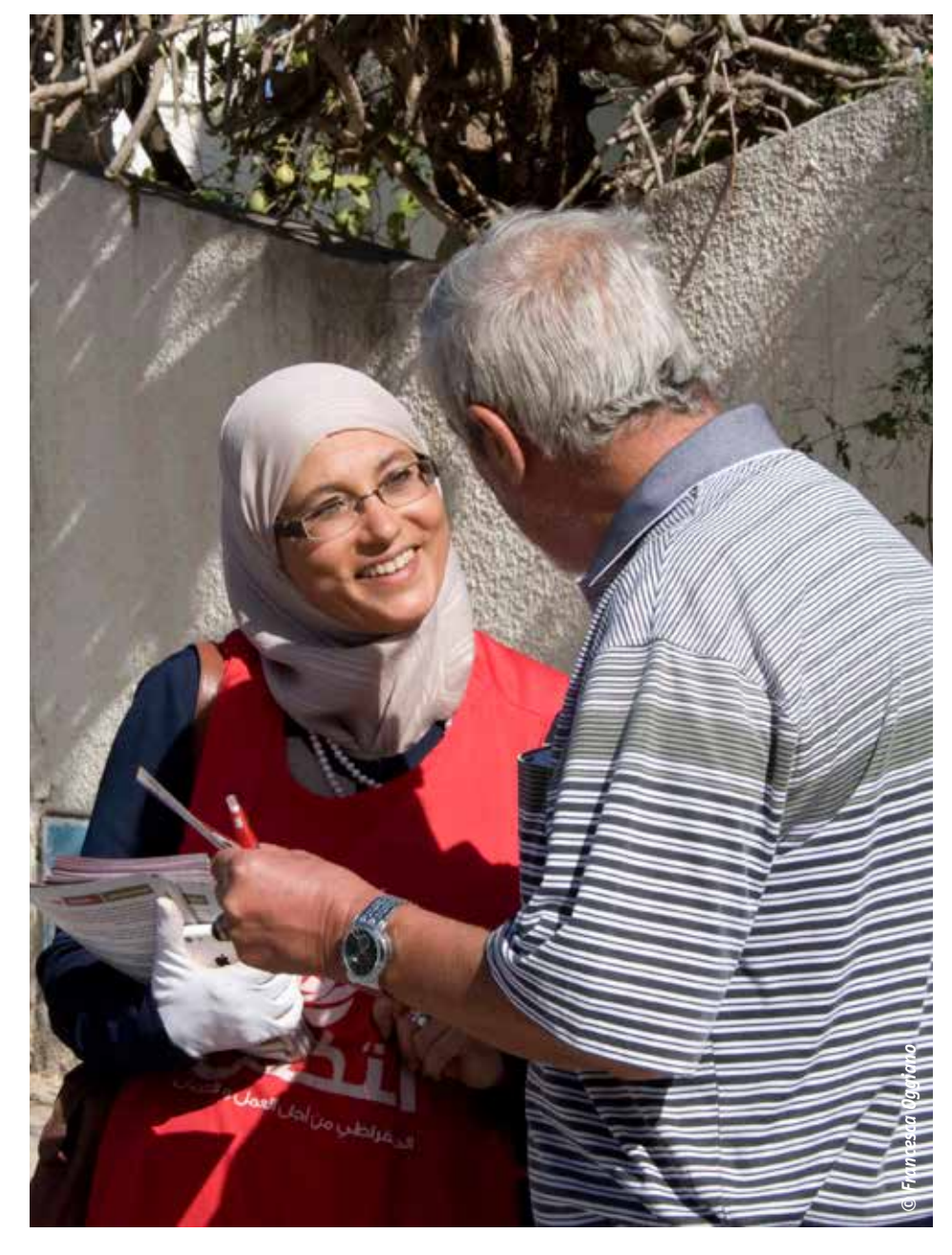
Tunisia, October 2014: the country's new Constitution guarantees, among other things, women's rights

philosophy, which emphasizes the individual, only leads us to poverty, division, war and tribal arguments, they claim. We first have to take care of the community and only then the individual. The western system isn't the system in which we can grow and offer young people a future. I understand this argument.'