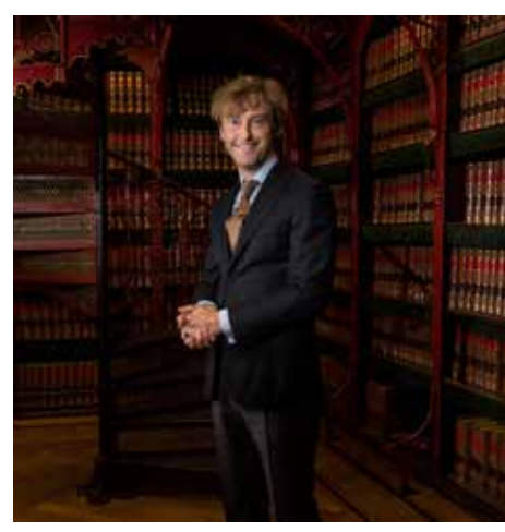
Joost Taverne (Dutch MP) 'Democracy is the best way of running a country'