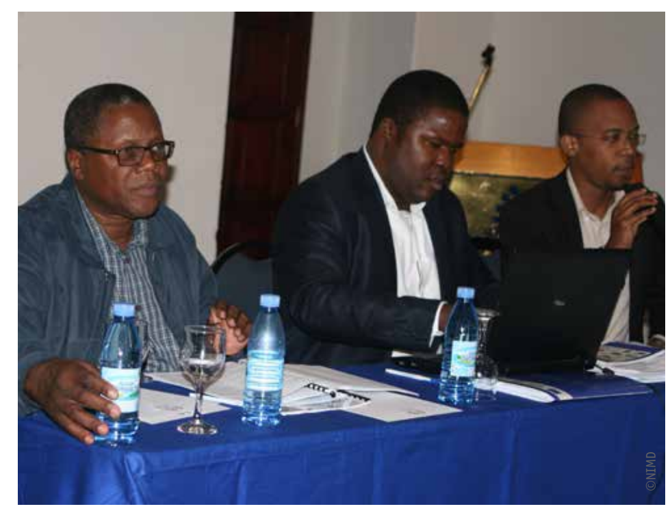
NIMD organized a meeting for dialogue on electoral reform in Mozambique

The influence of external factors must also be taken into account when measuring indicators of the results of democracy support, because the changes that you are trying to measure may also