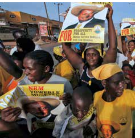
Uganda Towards democracy through dialoque