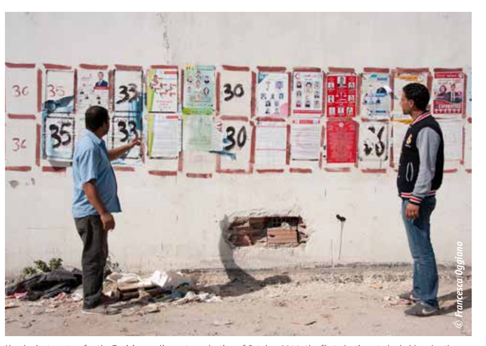
Men look at posters for the Tunisian parliamentary election of October 2014: the first elections to be held under the new Constitution

May the West expect the rest of the world to fully