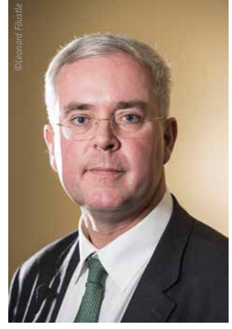
Chief Administrative Officer at the Association of European Parliamentarians with Africa (Awepa)