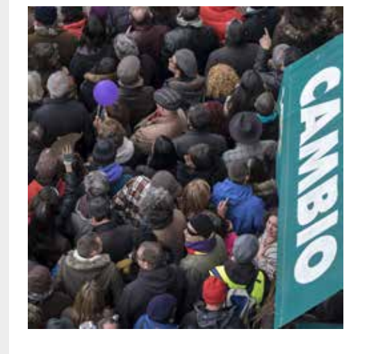
LiquidFeedback Direct participation increases involvement