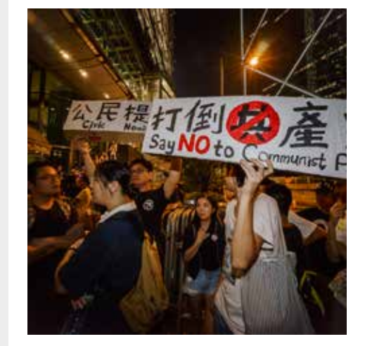
Deeper democracy An overview of the global state of affairs