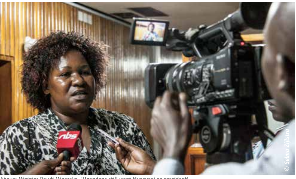
Above: Minister Daudi Migereko. 'Ugandans still want Museveni as presider Below: MP Florence Namanyana. 'It's time for Museveni to go'