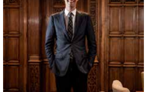
Sjoerd Sjoerdsma (Dutch MP) 'Multiparty democracy can be frustrating