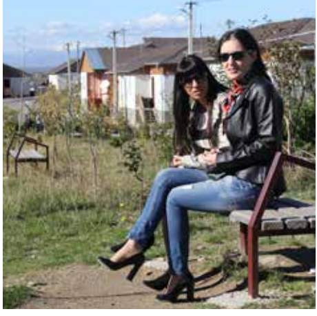
Georgia Democracy schools pave the way