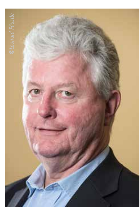
Hans Bruning Executive Director of Netherlands Institute for Multiparty Democracy (NIMD)

is about 30 percent or more. In a number of countries, we specifically support women. In Somalia, for example, women play a very important role, not only in families, but increasingly often in non-traditional places. Many clans there are led by chiefs, and women play an important, corrective role. From their position in the family structure, women have a constructive function for society.'