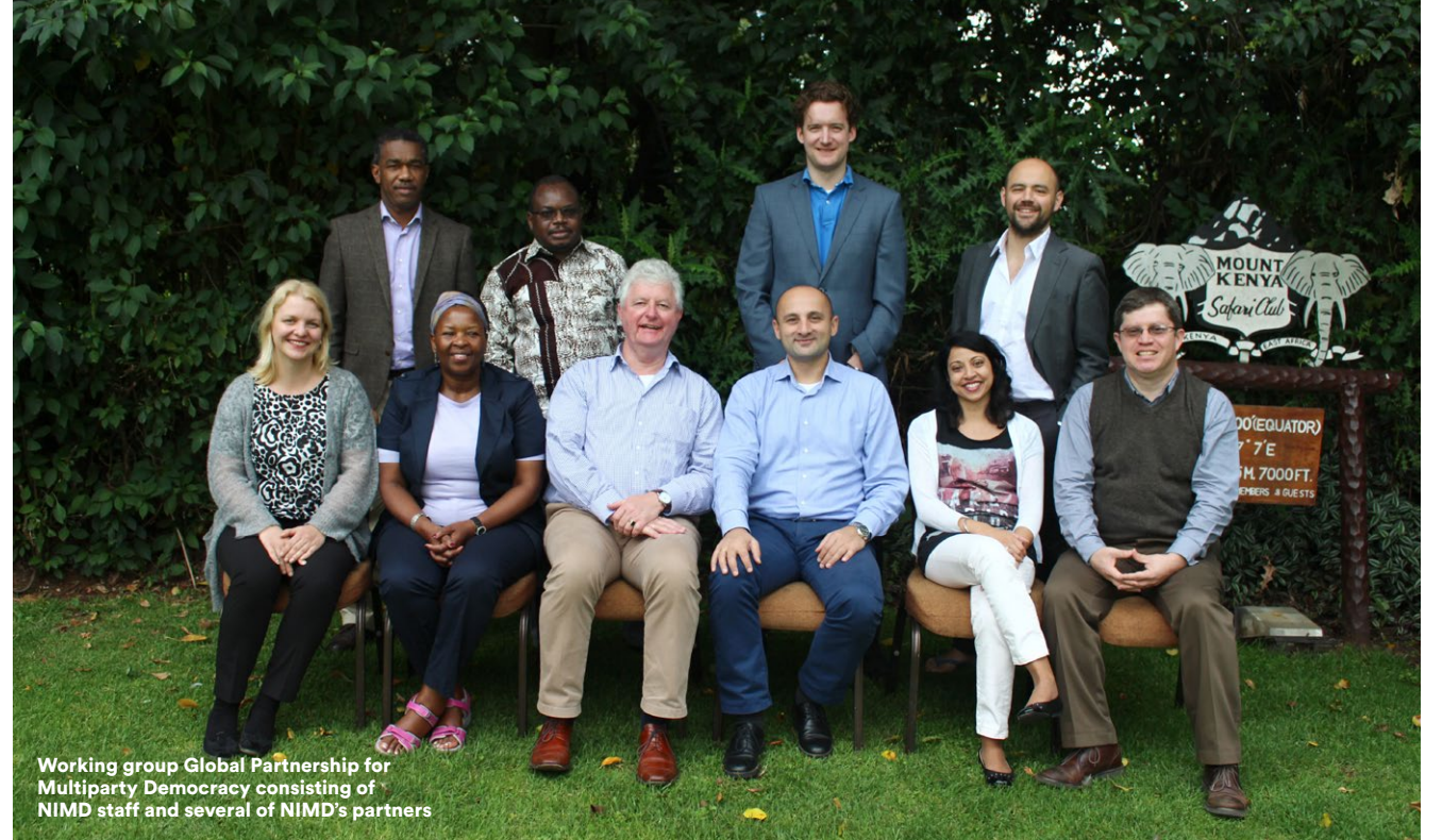
Working group Global Partnership for Multiparty Democracy consisting of NIMD staff and several of NIMD's partners