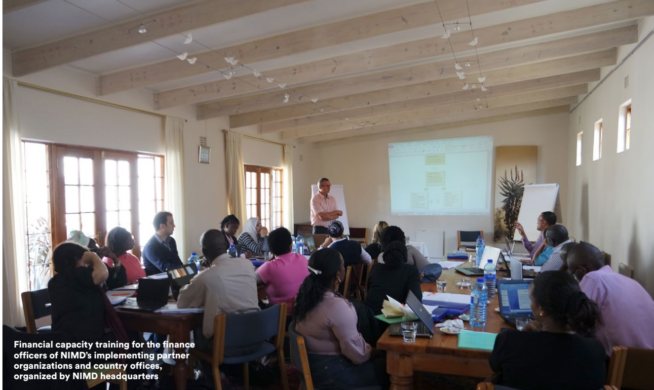
Financial capacity training for the finance officers of NIMD's implementing partner organizations and country offices, organized by NIMD headquarters