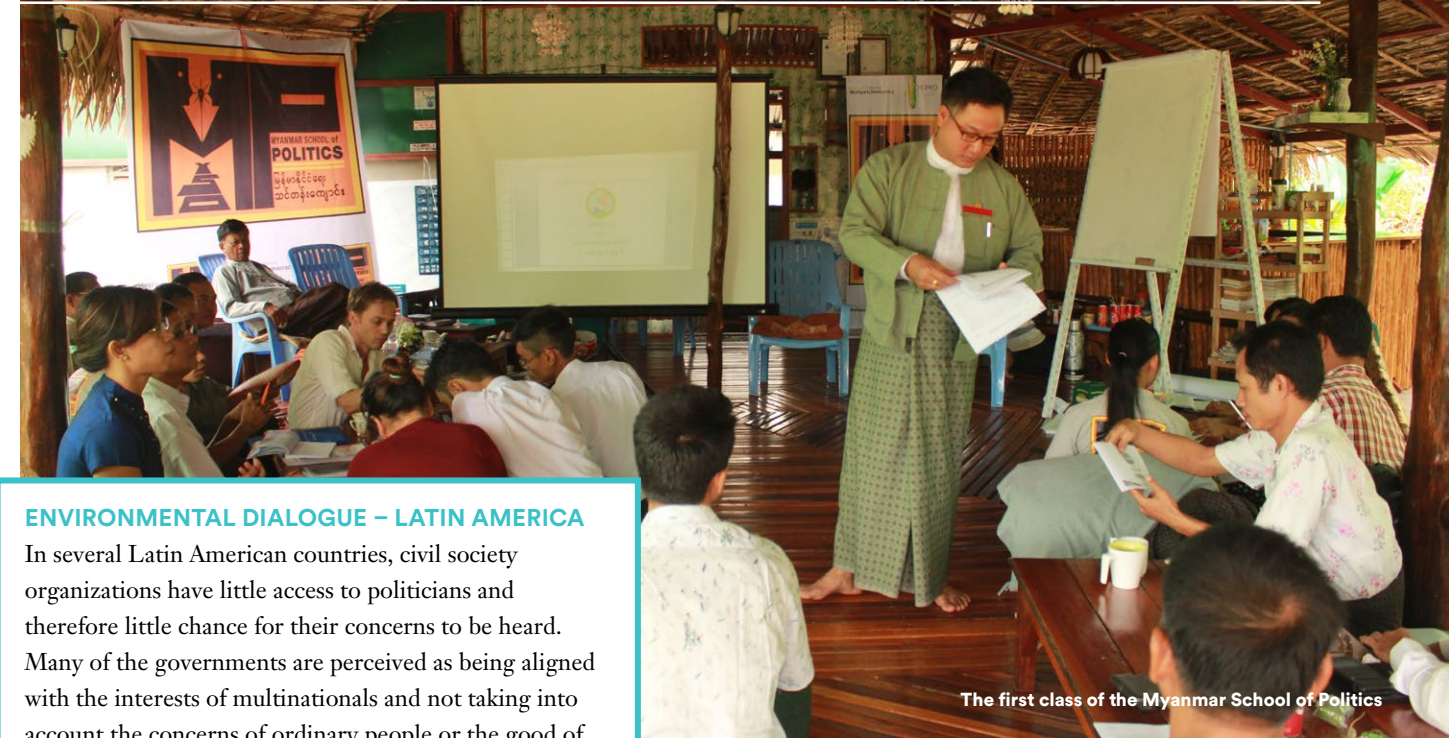
The first class of the Myanmar School of Politics

Several civil society organizations were involved in delivering sessions at the school, for example on the peace situation, governance and workers' rights.